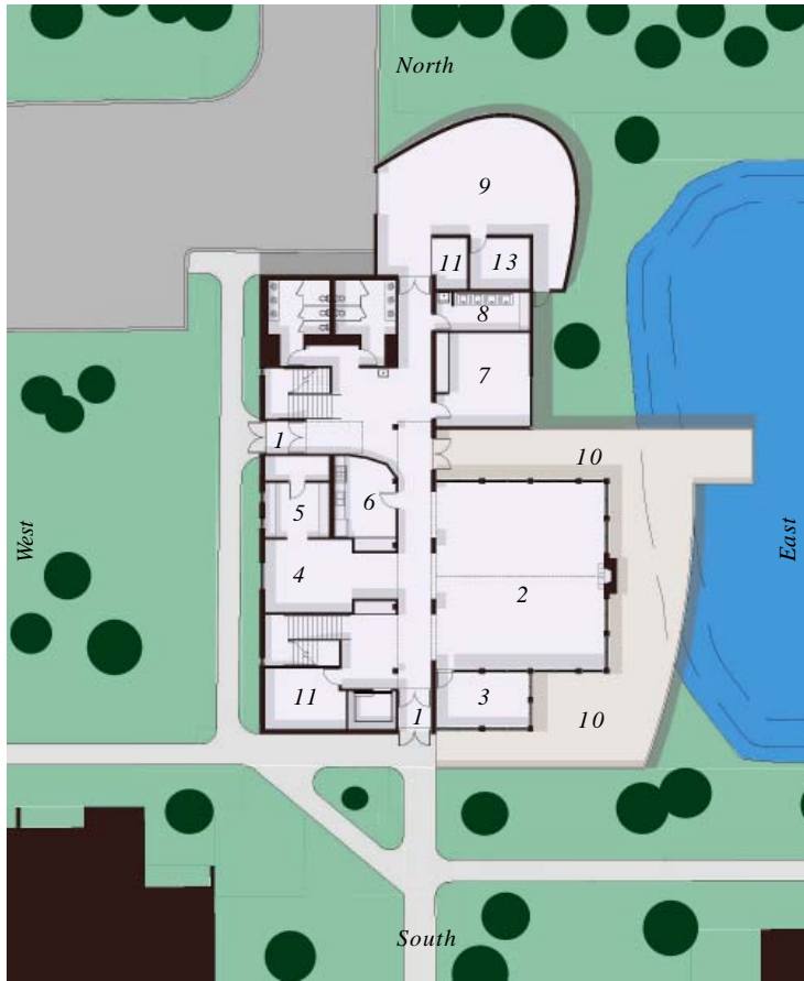
Site Plan / First Floor